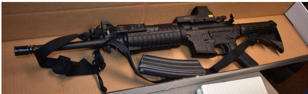
Colt AR15 Serial Number LBD023689 Department issued with TAC light mounted