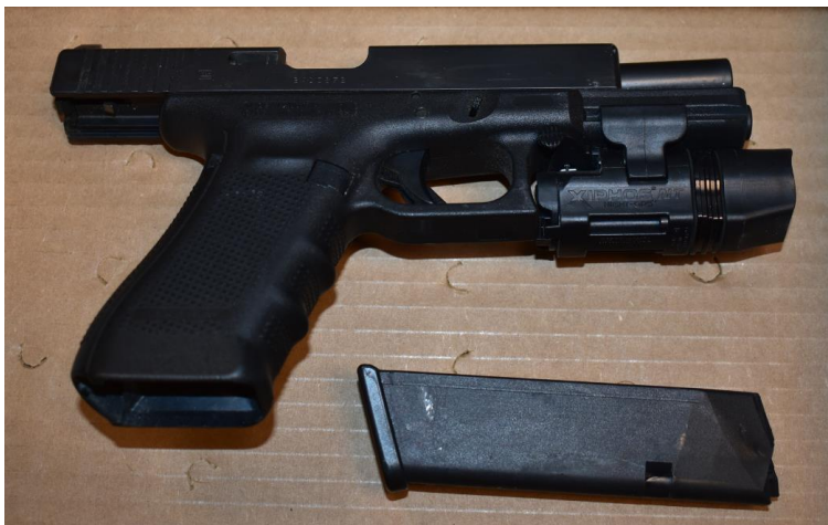
Glock 22 Gen 4, .40 caliber Serial Number BADZ872 Department issued with TAC light attached