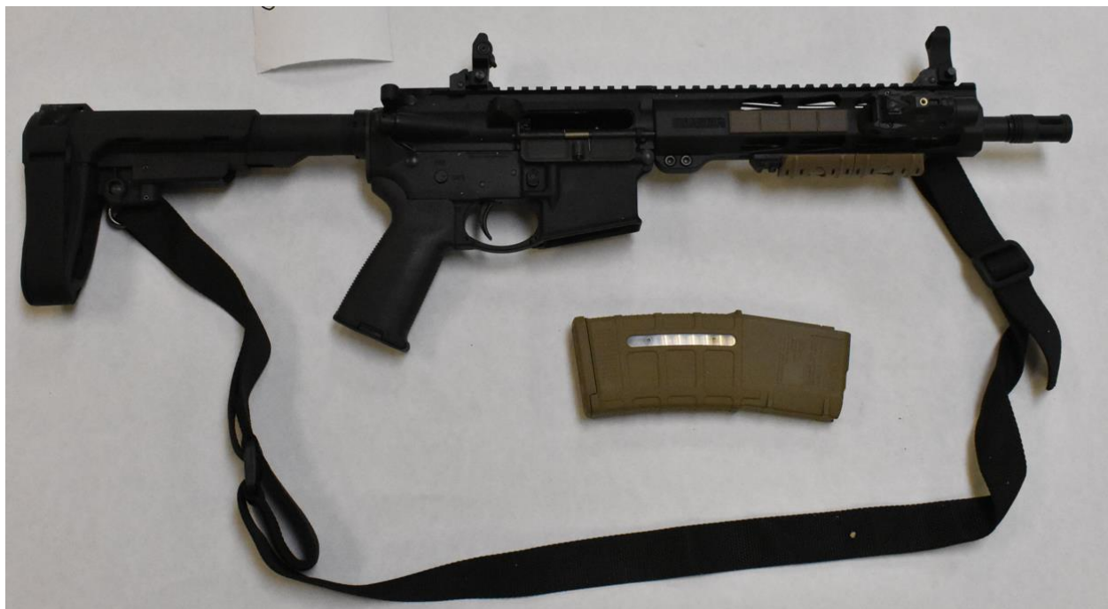
Ammunition and other firearms collected